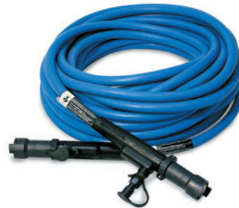
ProHeat liquid-cooled induction heating cable shown.

Designed with flexibility in mind, the ProHeat liquid-cooled induction heating cables can be wrapped into coils of various shapes and sizes to fit almost any induction heating application. Great for applications with geometries and temperatures that prevent the use of air-cooled blankets.